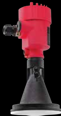
Lightweight Plastic Antenna Option